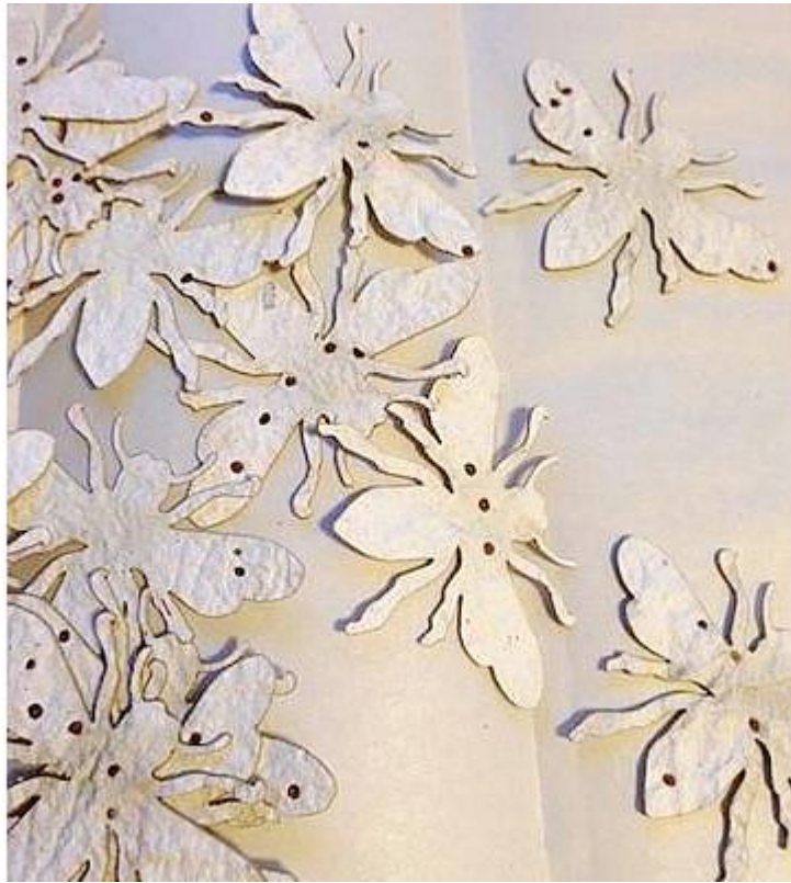
Cameron Cartiere & the chART Collective, For All is For Yourself (detail), laser-cut seed paper, 2015.